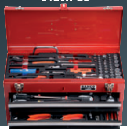
Mechanic's Toolbox 3126N-LU